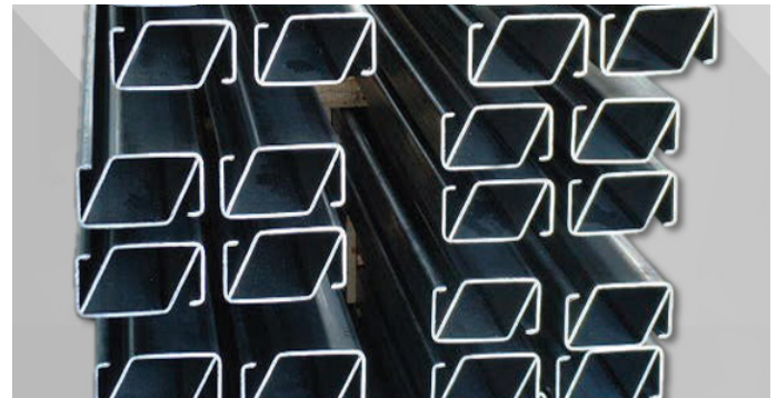
Transverse Chute Stiffeners - ready for despatch