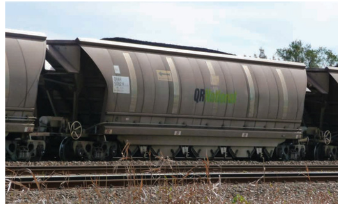
Rollformed Cant Rails - ready for despatch

Manufactured from specialised, state-of-the-art equipment utilising the latest technology, Australian Rollforming components are found in the coal wagons used by major coal rail haulage operators in Australia.